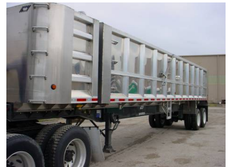
Frame type rendering trailer with separate blood tank