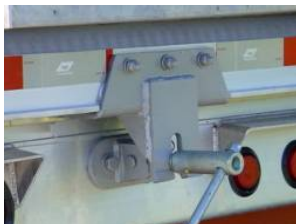
Bolt on steel winders for water tight tailgate