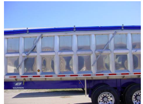
Frame type unit with horizontal and vertical side braces and two internal divider gates