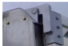
H.D. flame cut, bolt on hinge assembly