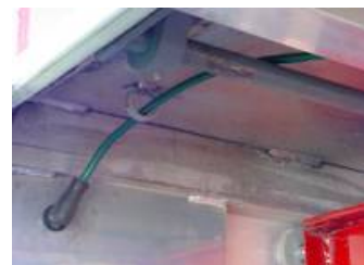
Sealed light harness