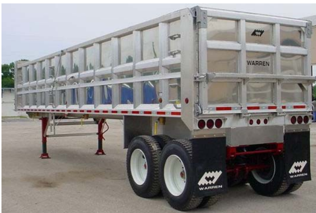
Frameless aluminum tipper trailer