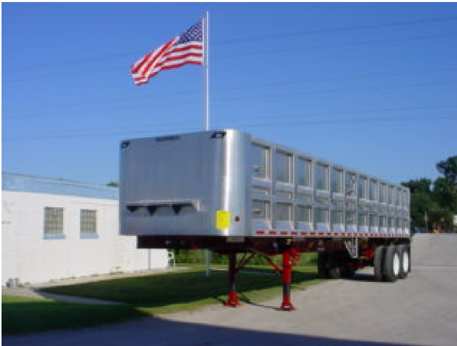
Frame type tipper with steel frame and aluminum body

Rendering Trailers - dumping and tipper, frame type and frameless