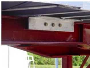
Frame to body connection