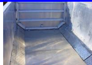
Internal gate w/ slope sheets