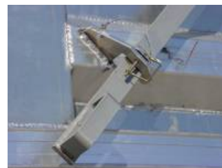
Internal gate control rod w/ safety latch pin