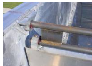
Gates lift up and swing away for unloading