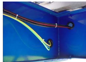
Color coded air lines